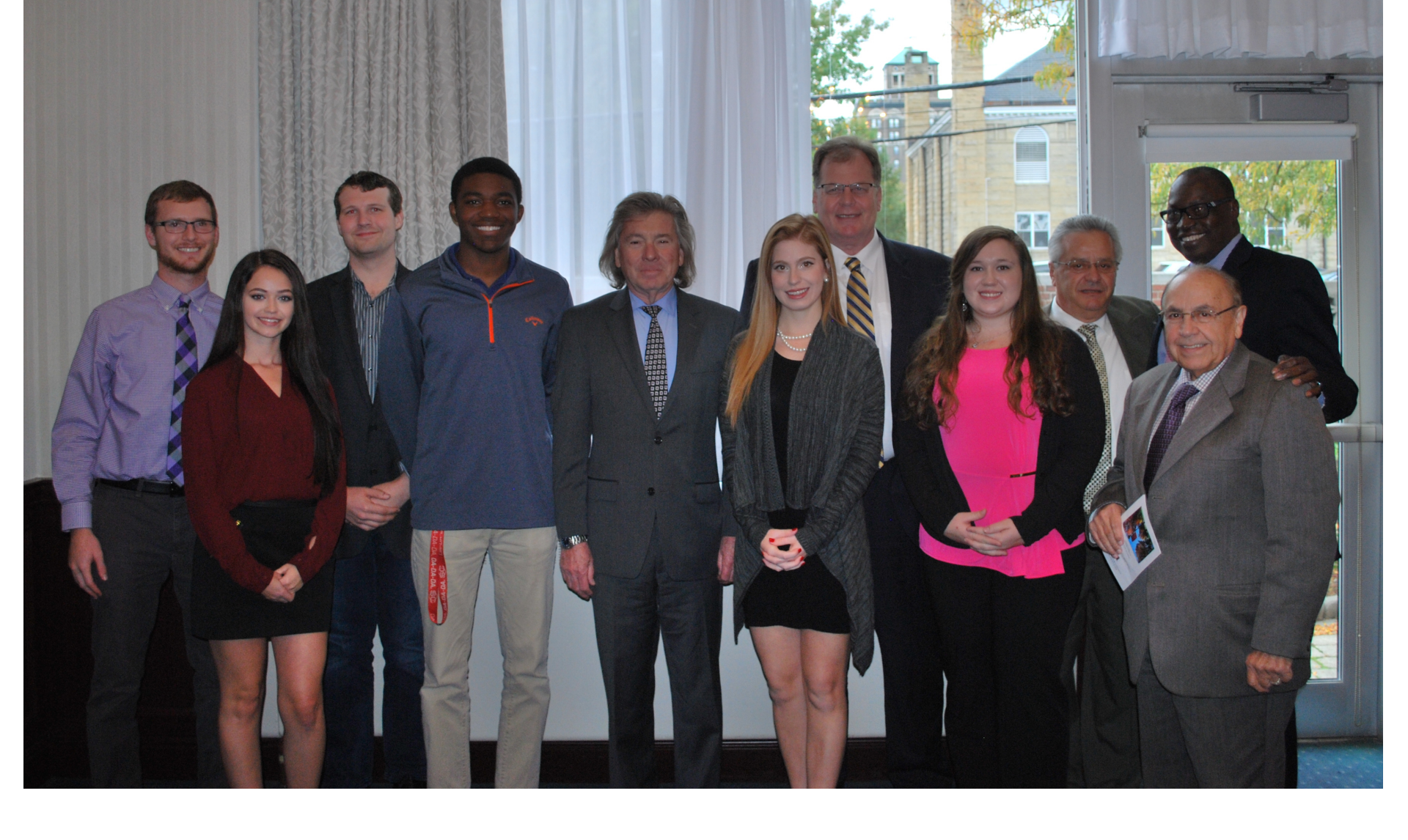
Pre-Law Society at Annual Luncheon